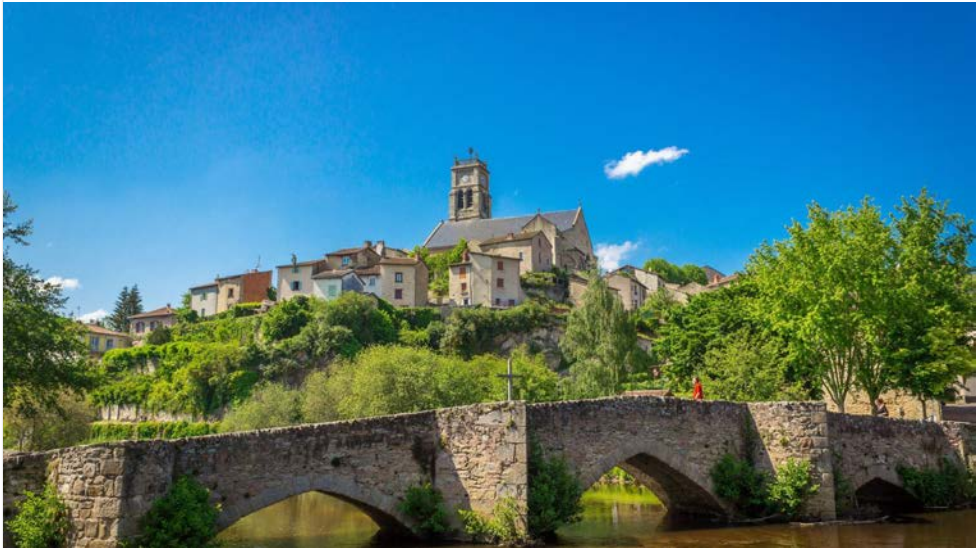
Bellac, a town in the Haute-Vienne department

Whether you are looking in Normandy, Provence or the Alps, there are plenty of bargains to be found