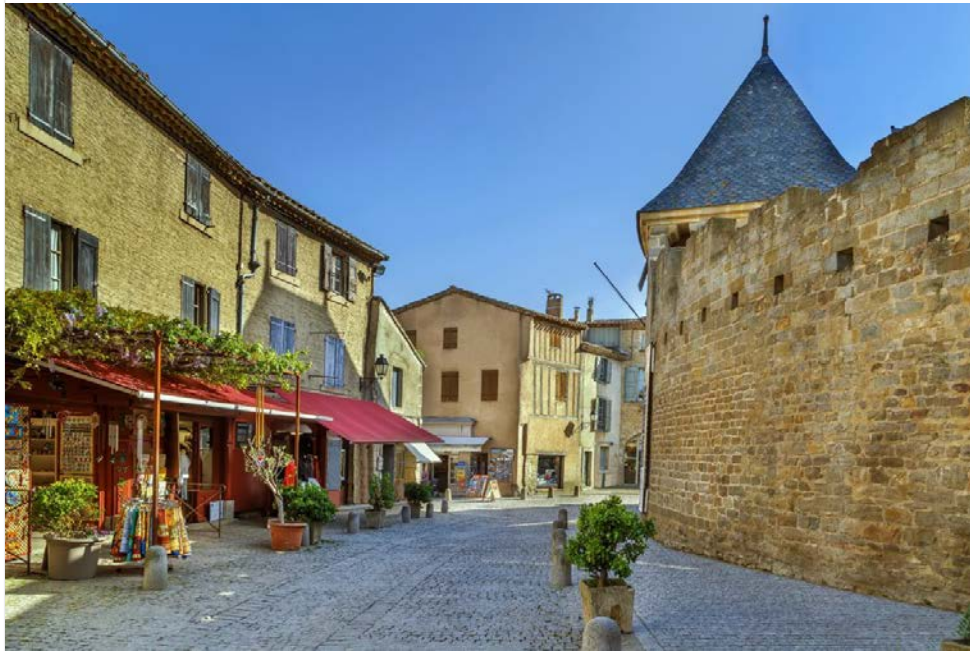
Cité de Carcassonne

appealing village atmosphere and is within striking distance of all the main tourist sites.”